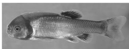
FATHEAD MINNOW

The quantitative Fathead minnow Vtg ELISA Kit is developed for a standard OECD test species used in many ecotoxicological testing laboratories throughout the world, the fathead minnow ( Pimephales promelas ). The assay can be used for analysis of both blood plasma and whole body homogenate samples).